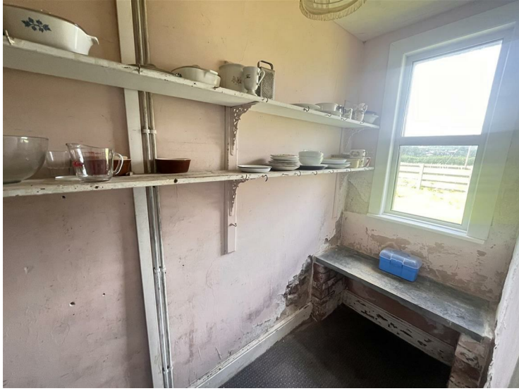
With original slate slabs, side window