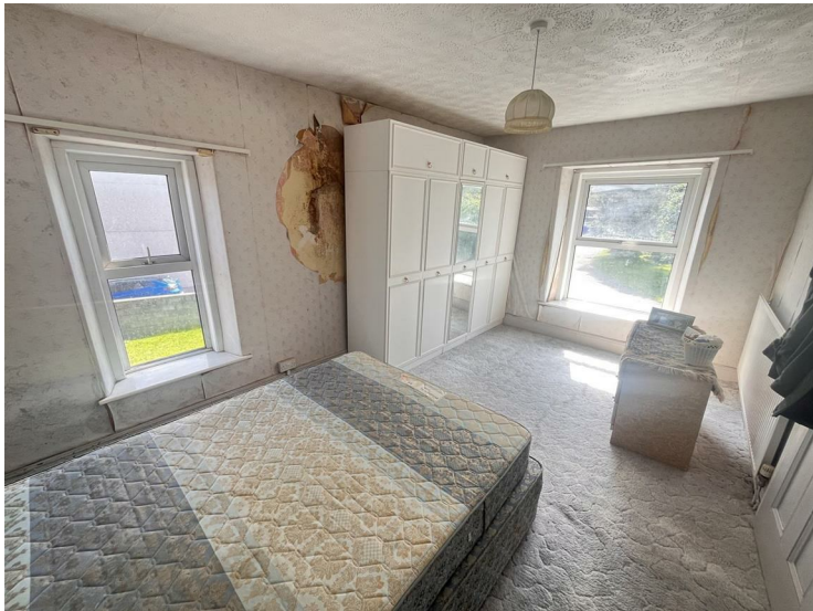
Radiator, side window