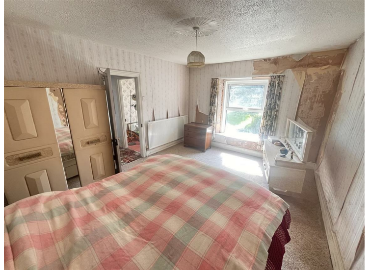
Double aspect windows, radiator